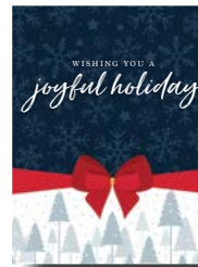
J.18 Beth Jones "Joyful Holiday" Inscription B