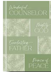
J.24 Beth Jones "Prince of Peace" Inscription A

His card design features the Benjamin Hubbard House, located near Moravian Falls, North Carolina in Wilkes County. It was built in 1778 and listed on the National Register of Historic Place in 2009.