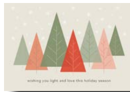
J.22 Beth Jones "Trees, Light, and Love" Inscription A