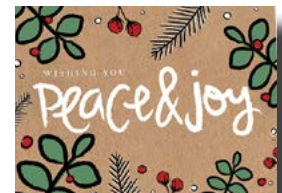
J.16 Beth Jones "Peace & Joy" Inscription B