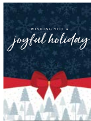
J.18 Beth Jones "Joyful Holiday" Inscription B