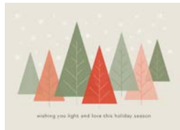
J.22 Beth Jones "Trees, Light, and Love" Inscription A