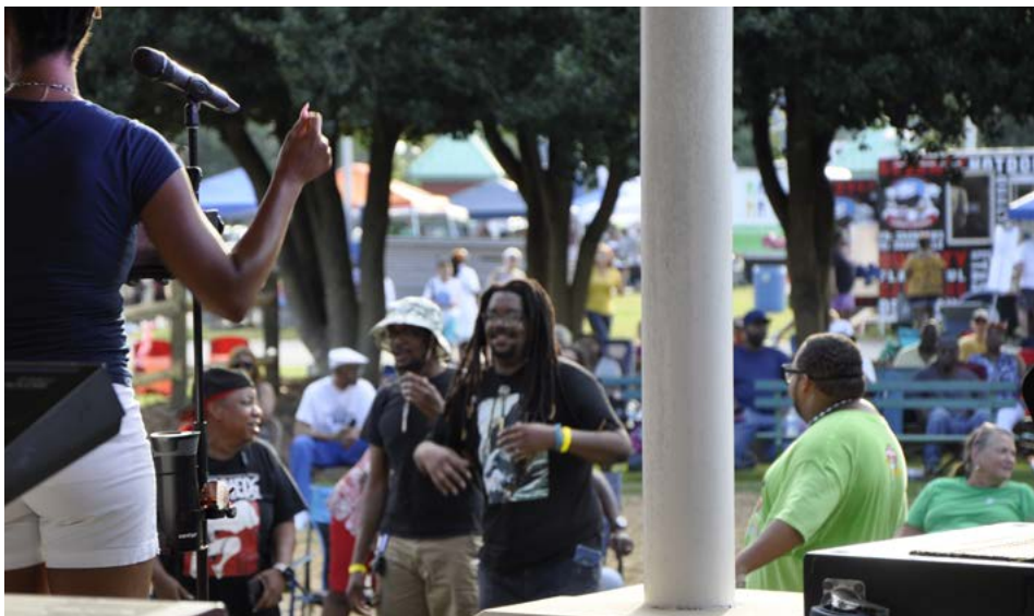
Rhythm & Hope photos