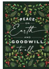
J.21 Beth Jones "Peace on Earth" Inscription A